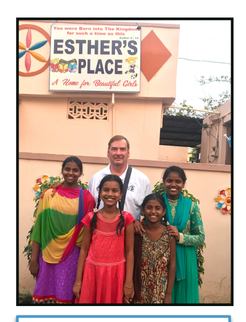
Four of our girls at Esther's Place in Guntur, Andra Pradesh, South India.

Often I get calls and pictures such as the two below left. Both needed immediate hospitalization, simple antibiotics with IV and they would have lived. These children are no longer with us. I rest in the thought they are in God's care now. At present, I have six of my own children that need desperate medical attention, but I do not have the funds at this time. Hopefully God will provide through His people. I know the sick we will always have with us but with children it is difficult not to be sad when their lives end so young when we might could have helped!