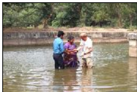
Conversion of a Muslim Woman

The cost of running this orphanage will be minimum compared to the cost in the Northeast due to location and lower prices in food, rent, and utilities. I do need for these five girls pictured here, to be