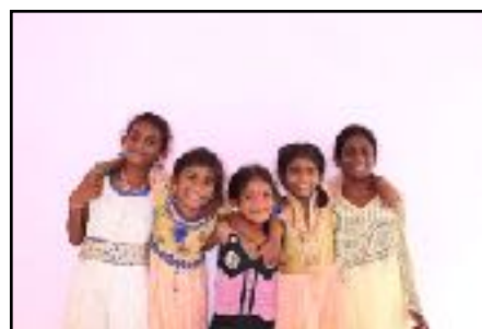
FIVE NEW SISTERS AT ESTHER'S PLACE