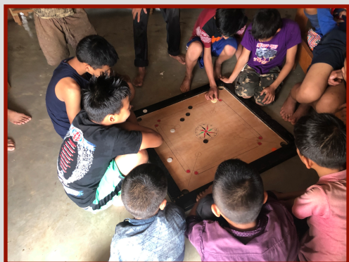
BOYS PLAYING CAREMBOARD

In need of several PowerPoint projectors as well as funds to purchase three educational TV's for the school.