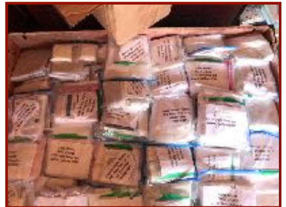
BIRTHING KITS CRATED FOR INDIA