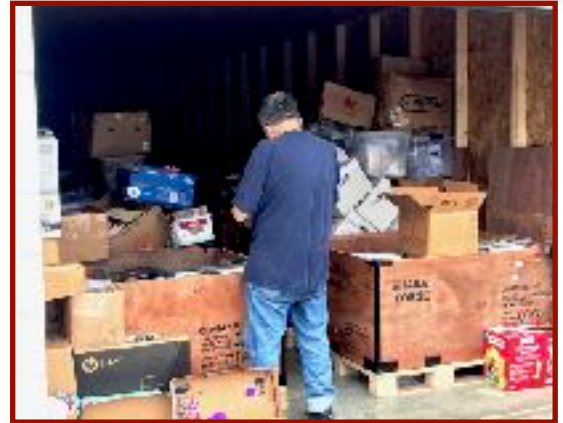
PACKING CRATES FOR SHIPMENT

With your continued prayers, support and mission visits I am excited about what will happen in the next ten years!